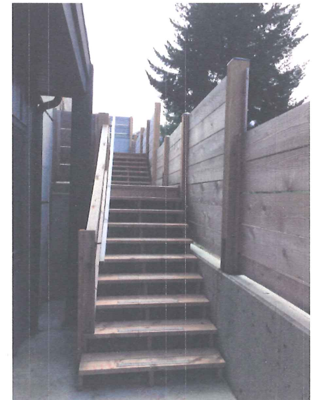
VARIANCE : WOOD STAIRS IN THE SIDYARD (WEST)