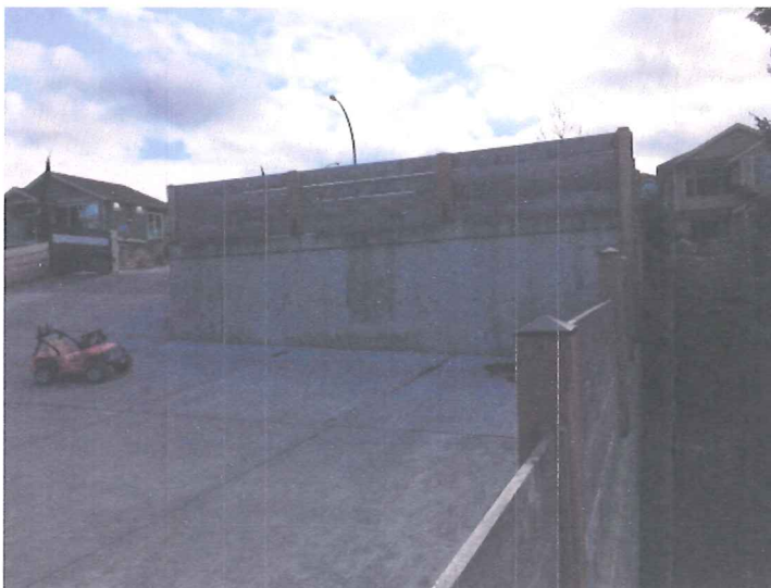
VARIANCE : INTERIOR FENCE

RECEIVED APR 03 2018 DVP 348 CITY OF NANAIMO COMMUNITY DEVELOPMENT