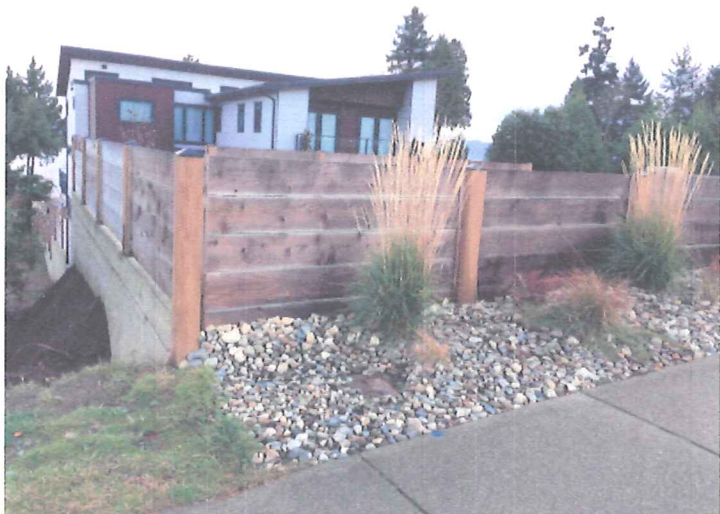
VARIANCE : EXTERIOR FENCE (WEST)