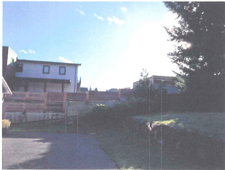
EXTERIOR FENCE : WEST ELEVATION