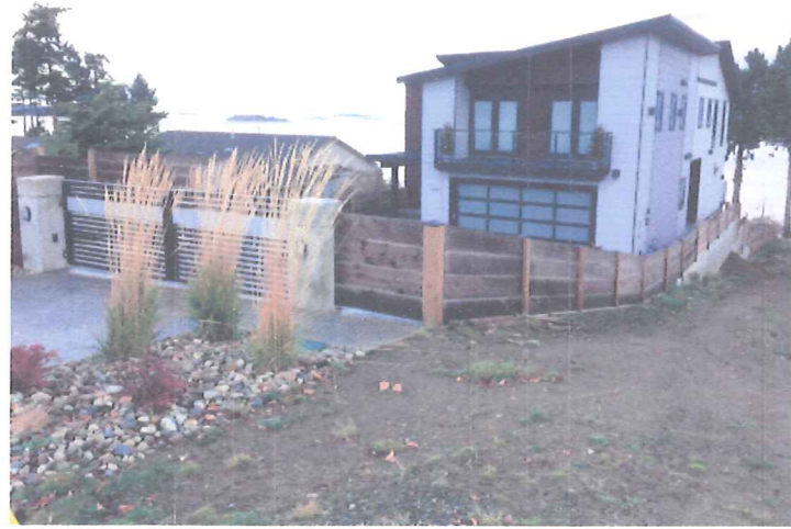
VARIANCE : FENCE AND GATE IN THE FRONT YARD