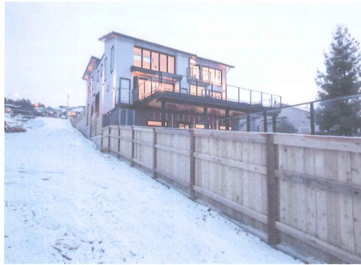
EXTERIOR FENCE : EAST ELEVATION