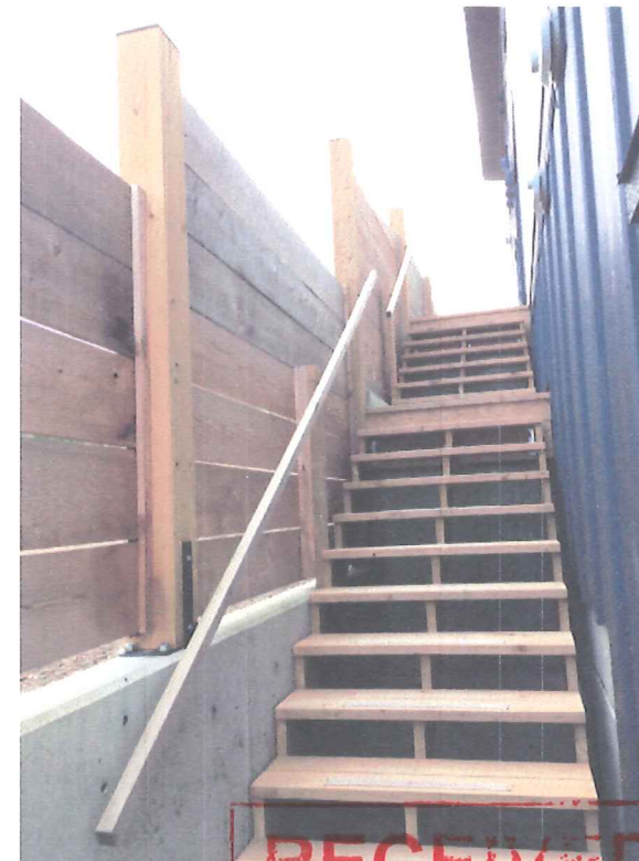
VARIANCE : FENCE IN SIDYARD (EAST)