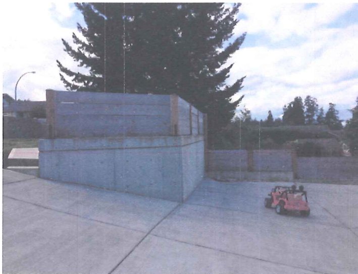
VARIANCE : INTERIOR FENCE